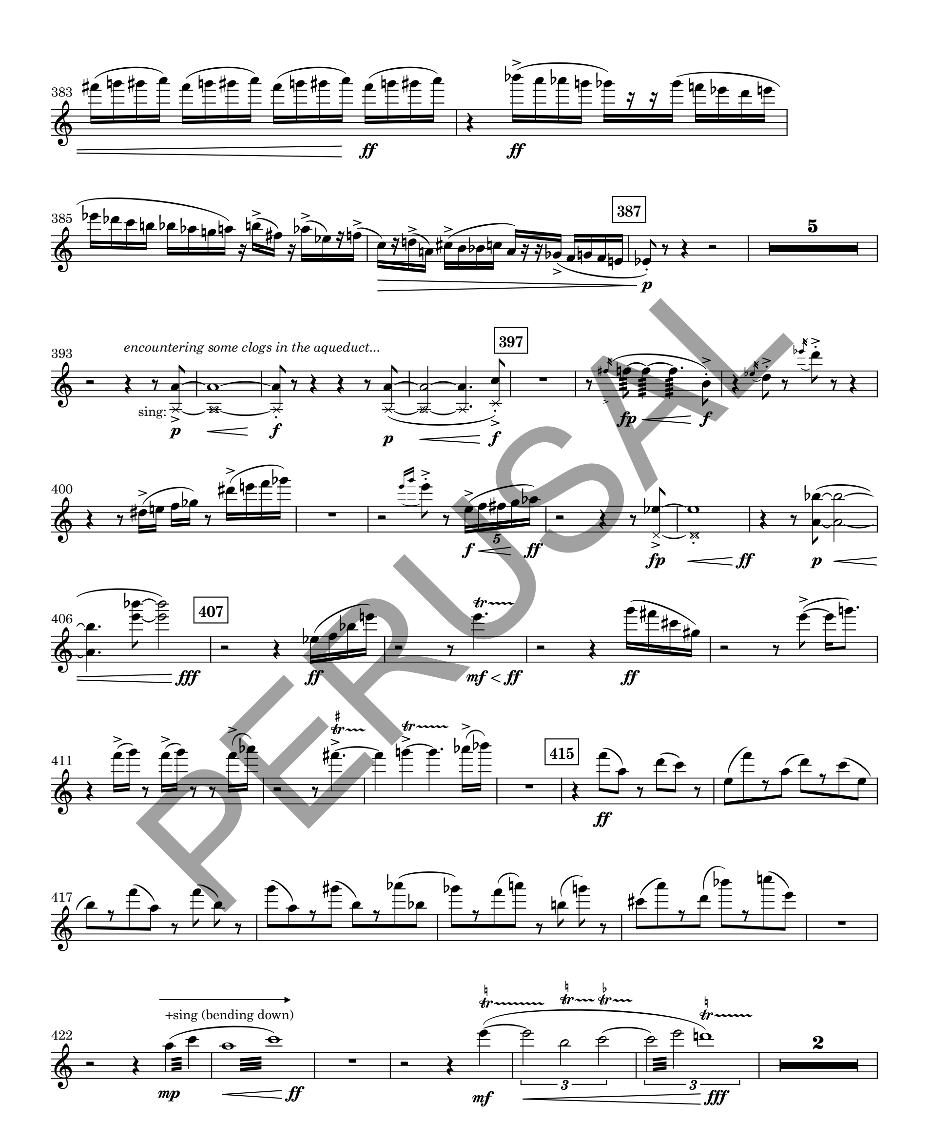
FLOW - page 11